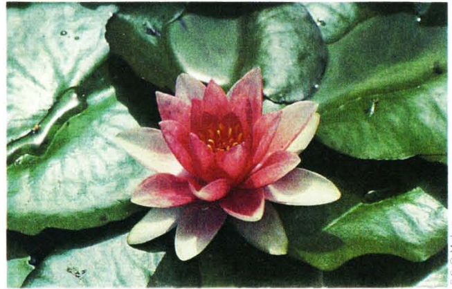
Nymphaea 'Mrs Richmond'