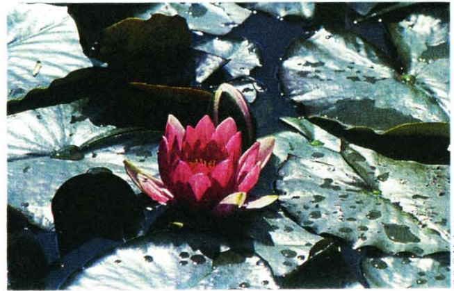
Nymphaea 'Charles de Meurville'