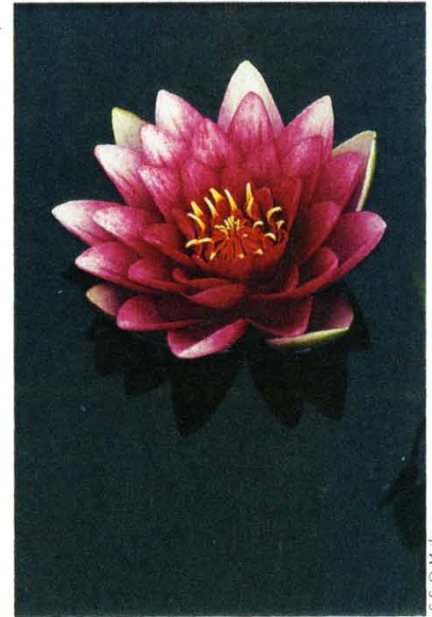
Nymphaea 'James Brydon'