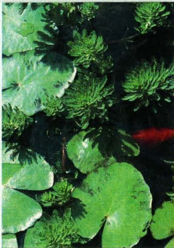
S & O Matthews

Golden orfe and golden rudd shoal attractively near the surface, but they require higher oxygen levels than the small carp, so must be reserved for lakes, larger pools or where fountains or waterfalls are operating constantly. Koi carp and tench are best suited to pools specially adapted to their culture or for lakes, as they root up plants and muddy pool water. In all cases, the number of fish stocked should be no more than two inches of fish body length for each square foot of pool surface.