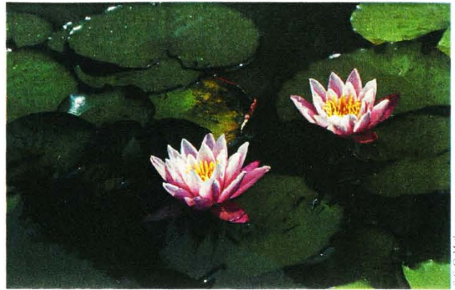
Nymphaea 'Pink Sensation'