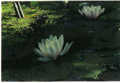
N. odorata 'William B. Shaw'